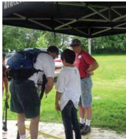
Volunteers assist Triple Threat with bike repair at Copley II Field.