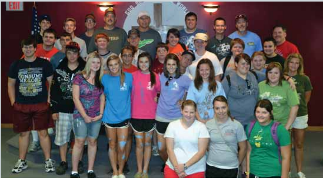
Volunteers from Awake Student Ministries from First Baptist Church, Muskogee, Oklahoma.

of Muskogee, OK. They had a real desire to interact with the residents of Wayside Cross as well as a desire to truly bless us through the work that they did throughout the week. These students were some of the most passionate and hard-working youth that we have had. Not only did they work hard but they were able to finish every project that we gave them in half the allotted time. The most impressive part of this volunteering opportunity was listening to the students as they did debriefings in our chapel. They had a real grasp of what it means to be a follower of Jesus Christ and how serving and compassion are a part of that call.