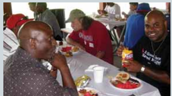
Wayside Cross Ministries Staff, Volunteers and Residents enjoy a good old-fashioned Picnic.