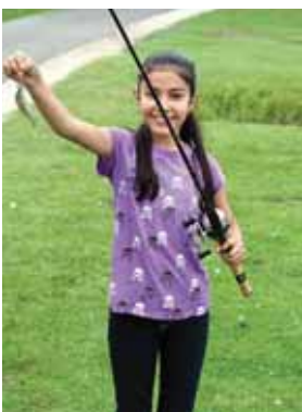
A girl from Aurora shows off the fish she caught during the fishing outreach.