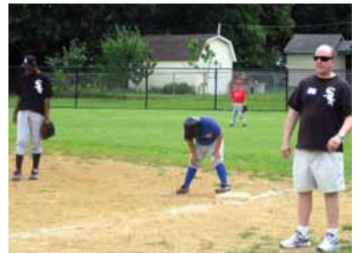
Men from Village Bible Church help coach during the ANBL All-Star Game.