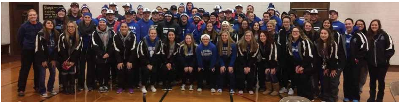
Aurora University at Walk a Mile in My Shoes 2017

P.S. There will still be a pancake breakfast (in Aurora) for those who brave the frigid temperatures. Come join the Aurora University Baseball and Softball teams!