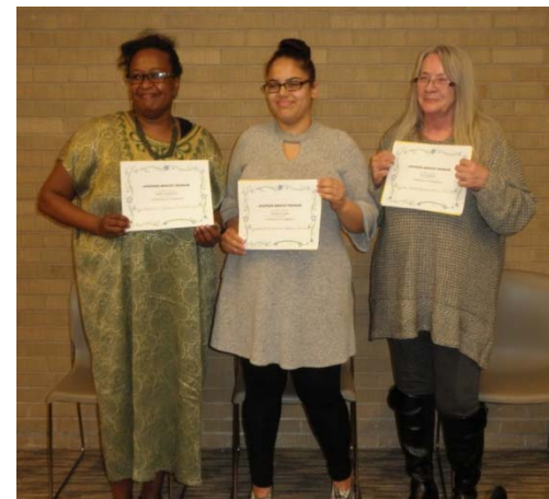
Six Month Celebration Celebrants (March 2018)

LIFESPRING MINISTRY SERVES AS A LONG-TERM TRANSITIONAL PROGRAM RATHER THAN AN EMERGENCY SHELTER, TEACHING LIFE SKILLS TO WOMEN WHO HAVE LOST THEIR WAY. AN ARMY OF VOLUNTEERS JOIN WITH STAFF TO MAKE THIS SIX-MONTH PROGRAM A STEPPING STONE TOWARD INDEPENDENT LIVING. AS PART OF THIS UNIQUE PROGRAM, WOMEN RECEIVE CHRISTIAN COUNSELING, EDUCATION, AND SUPPORT TO PREPARE THEM FOR THEIR FUTURE.