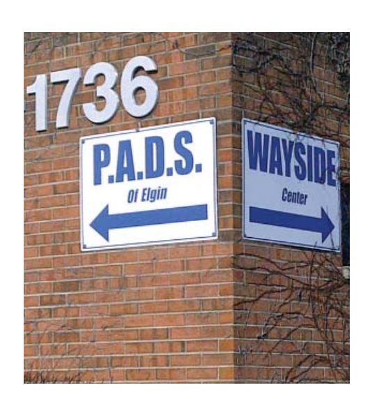
Elgin Center volunteers

We have no homeless in Elgin, was the incredulous comment by an area resident. In reply, I tried to politely explain that wasn't quite true, but he could get that impression because of the effective collaboration of organizations like The Wayside Center and PADS of Elgin. Together, Wayside Center and PADS are like two sides of a coin. While many of the guests and services intersect, the 360 degree care provides attention not only to physical needs, but also psycho/social and spiritual ones as well. In short, Wayside is Day and PADS is Night .