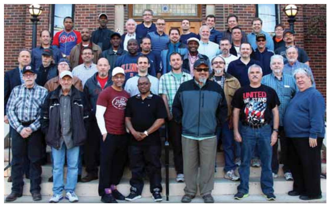
Designed for a Work - Class of 2016

At the conclusion of the 12 weeks, the attendees leave with a Biblical world view of work, a deeper understanding of who they are in Christ Jesus, and a road map to follow regarding how to proceed with their vocation plan.