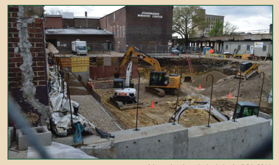
A busy day down in the hole. April 24, 2014.