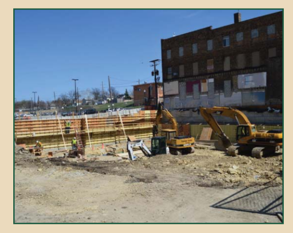
April 21, 2014.