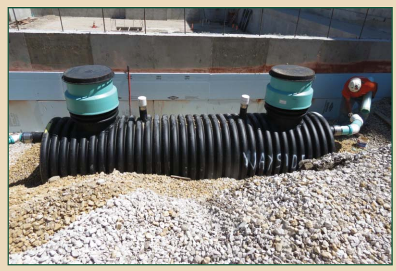
Grease Trap going in June 5, 2014.