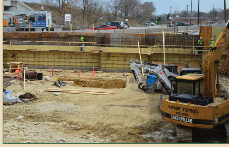
Forms are set for the front wall of the building. April 21, 2014.