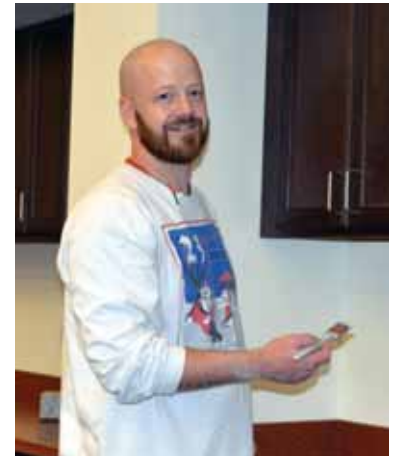
Volunteers and residents work together.