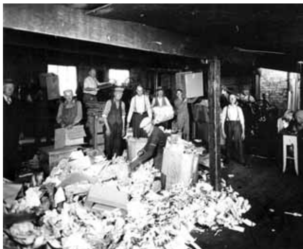
Times have changed but the "mission" of doing God's work has not.