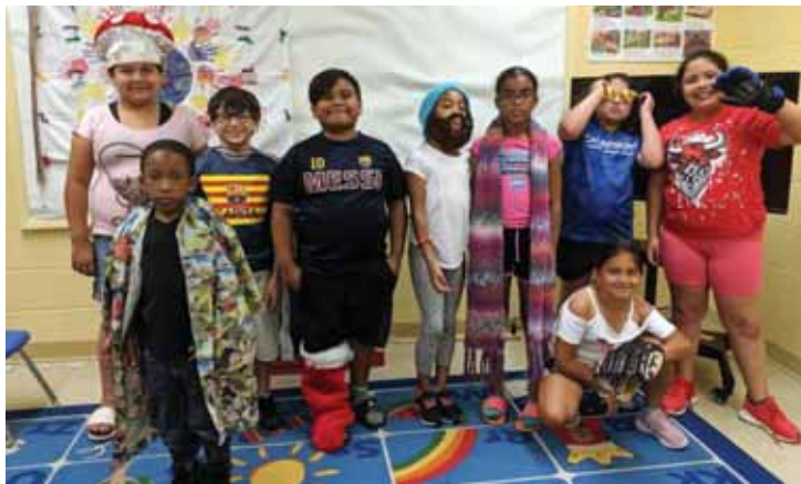
Dressing up as Bible characters.