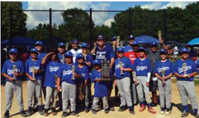
2019 Championship Team, the Dodgers