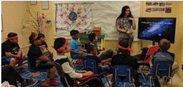
God created the heavens and the earth!

Bible Time this summer was spent going through the Old Testament stories and learning that Jesus is the reason we can have a relationship with God!