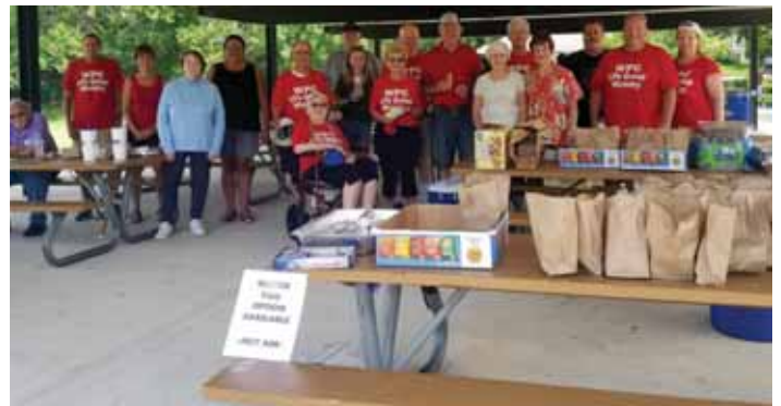
Westminster Presbyterian Church sponsored and served lunch at the All Star game.