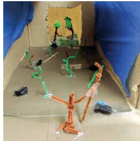
Moses parts the Red Sea!

..... Special speakers, organizations and volunteers share their passions with our kids all through the summer.