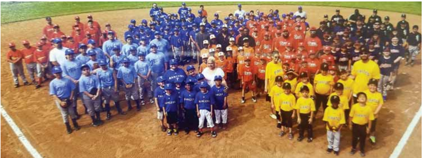
2019 Opening Day