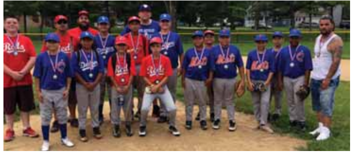
2019 All Stars, the National League